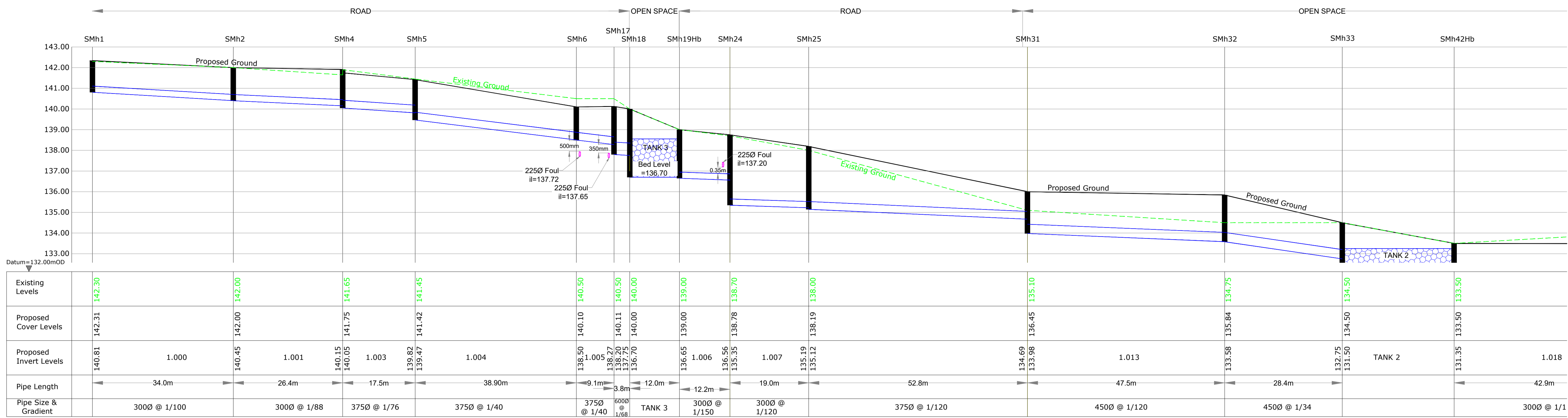
S/W Longitudinal Section SMh1 to SMh42Hb

Vertical Scale 1:100 Horizontal Scale 1:500